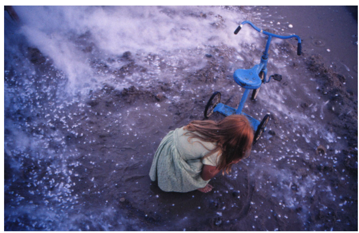
She wondered what a nuclear winter might look like. The Child, Shadow Panic (Nash 1989)