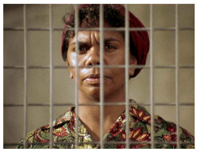
Listen to us